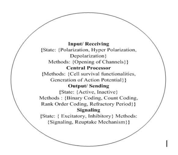
FIGURE 3. SCS prototype object