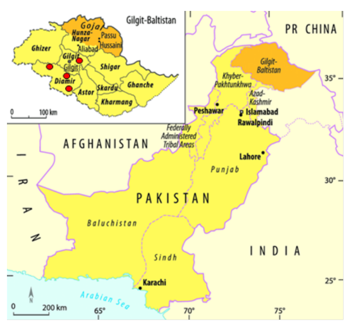
Figure 1: A map showing geographical location of Gilgit-Baltistan and sampling sites indicated by red-circles.

along with locality was also noted during sampling. Blood samples were transferred to EDTA vacutainers for plasma separation. All samples were properly labeled by placing date and sample ID on the vacutainers. The ID was traced from the data file containing information about the age, breed, gender, locality and geographical location of collected sample. The samples were transferred to research lab of Microbiology, FIRST in ice packs.