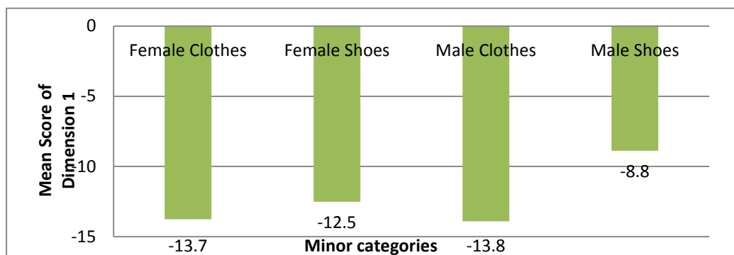
Figure 2: Comparison of Blogs of Minor Categories: Males’ Shoes & Clothes and Females’ Shoes & Clothes with Respect to Dimension 1: Involved vs. Informational Production

The figure shows that fashion blogs of both categories are falling in the pole of negative scores means the fashion blogs are informational in their nature as having negative scores. Both products contain negative scores: -11.5 and -13.1. And co-occurrences of linguistic features makes the whole difference, as in this respect Biber (1988) has argued “Dimensions are bundles of linguistic features that co-occur in the text and become the cause of some underlying change” (p. 55).