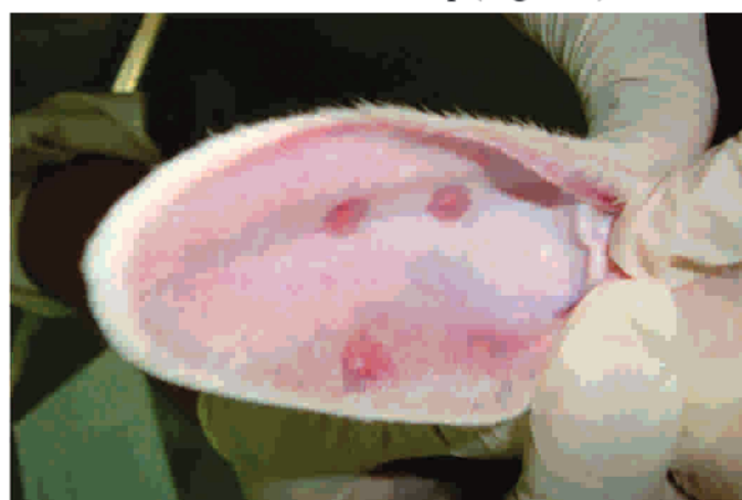
Figure 1: Multiple Keloids produced in one Rabbit

Keloids produced were considerable on examination. They were of solid consistency. They were of round shape, and their colour was red. They had a smooth surface, and were hairless. Keloids were present even after twelve months of follow-up (Figure 1).