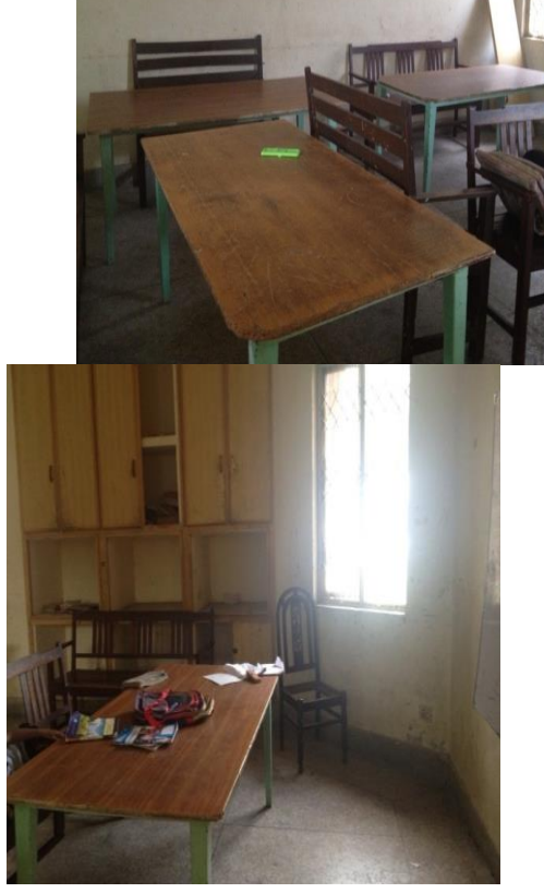
Figure 5. A classroom at the orphanage

Classroom environments, as supposed by students, have a number of characteristics which influence their growth and learning. Classrooms that are perceived as protected, warm, helpful and non-threatening support learning and accomplishment (Charles, 2005). The participants raised a number of concerns about their classroom environment which were further substantiated by us during the formal and informal observations.