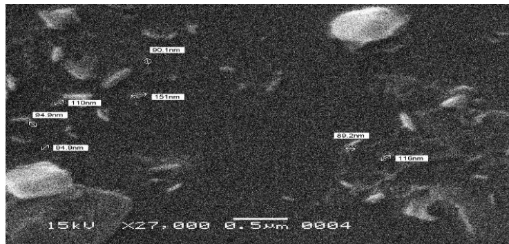
Fig 2. SEM images of Silver nanoparticles, 82nm to 156nm detected in aggregated form.