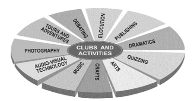
Fig. 1: The Common Co-Curricular Activities