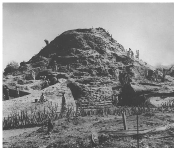
Figure 4 : Excavated Stupa, Devnimori