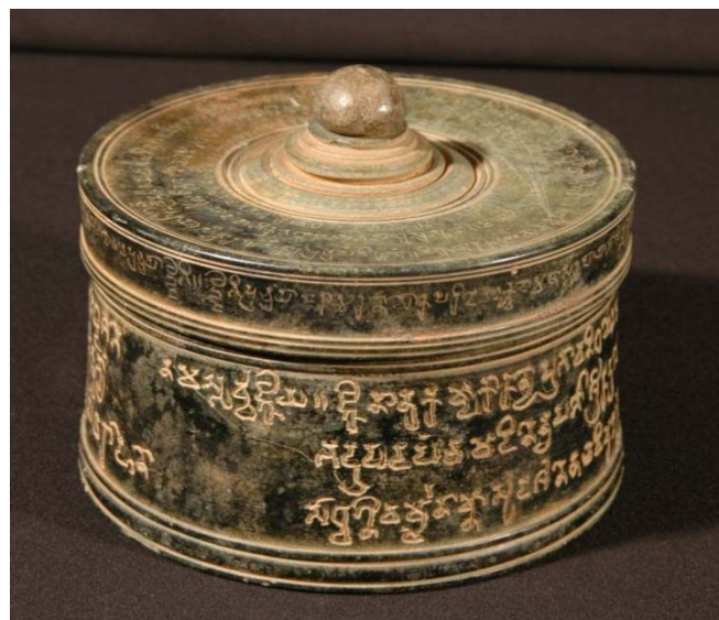
Figure 6 : Relic Casket