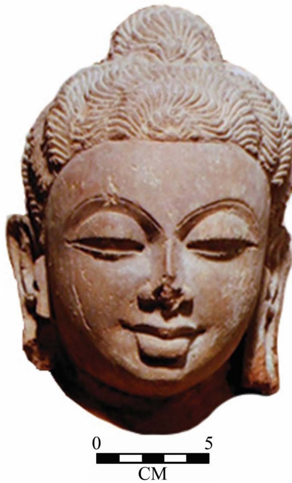
Figure 5 : Terracotta Buddha images, Devnimori