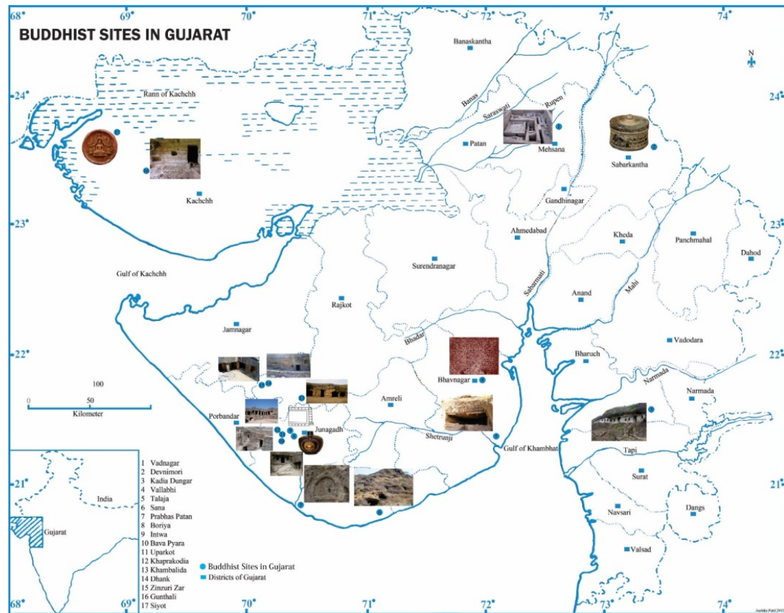
Figure 1. Buddhist sites/settlements in Early Historic Gujarat