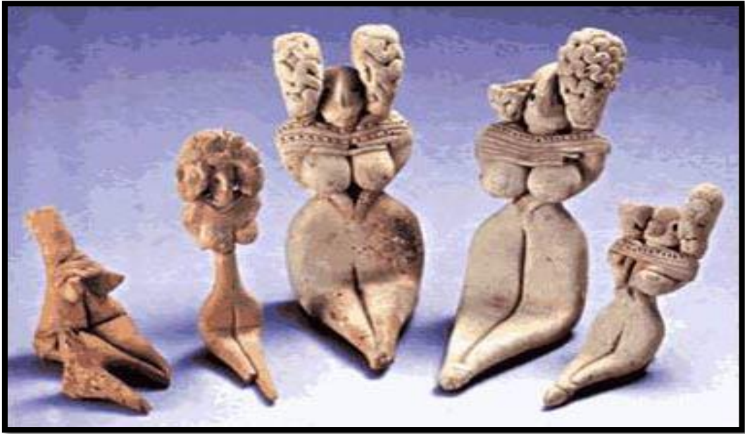
Figure 3. Terracotta figurines of Mehrgarh