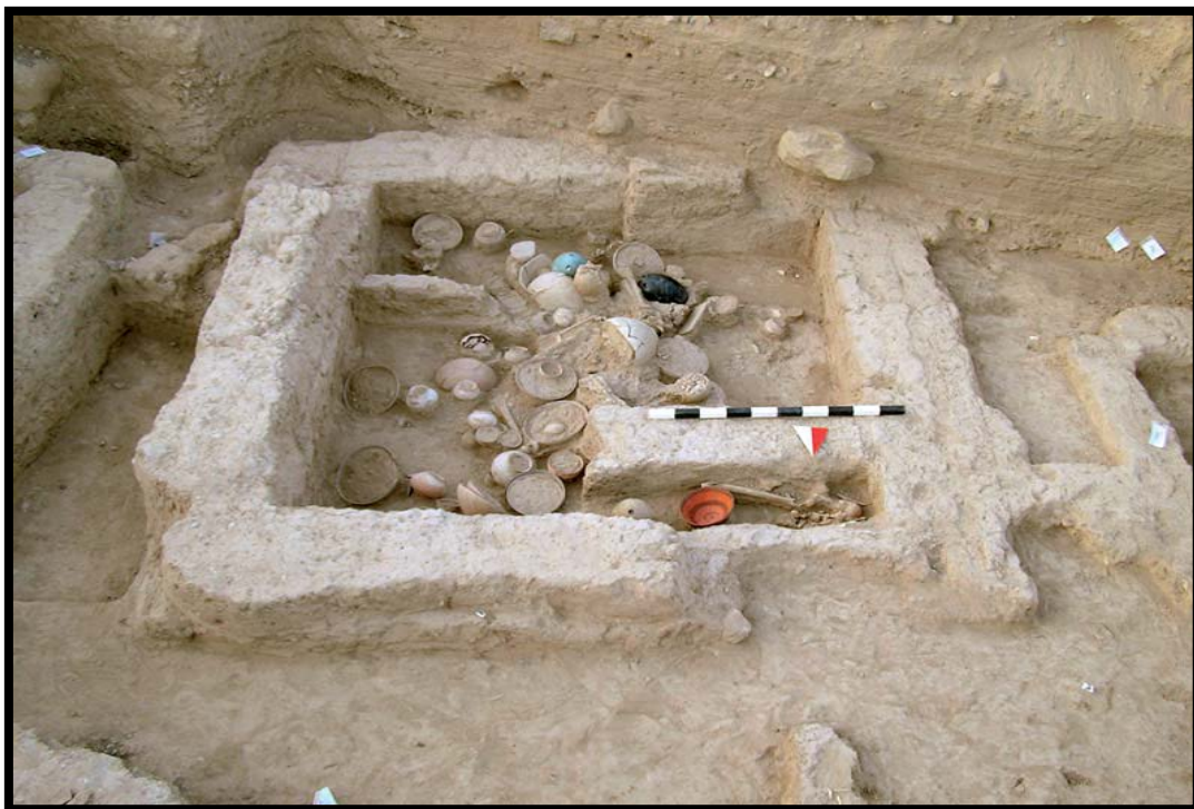
Figure 2. SohrDamb/Nal period I. multiple fragmentary burials with grave goods