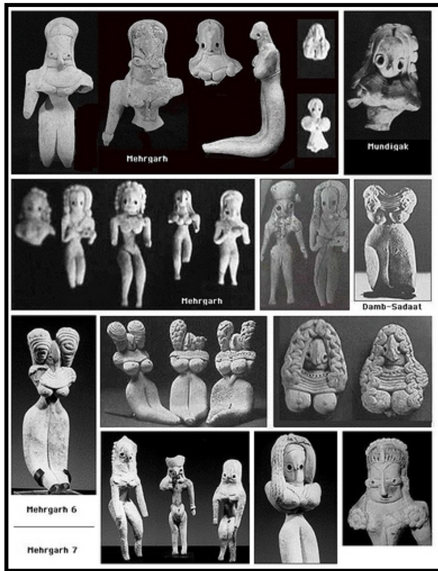
Figure 4. Terracotta figurines of Balochistan Traditions