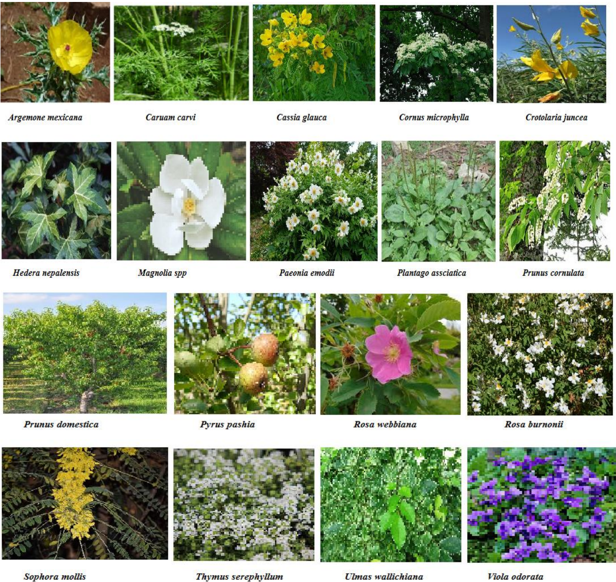
Fig 2. Some known Himalayan species that are expected to be rare or absent in Murree, Pakistan.